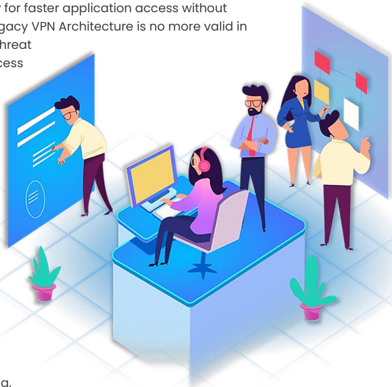
AccelPro ZTNA Gateways

AccelPro Automates ZTNA Fabric build between your Corporate Network & End User Device and User Identity. The Automated features such as Automatic Email Triger immediately after User Account is created, Automatic Endpoint Scanning of End User devices, Automatic MAC ID or Device ID Binding, Automatic Password Expiry Emails, Automatic EPS Updates to & Clients makes ZTNA Process Automated which results in End to End Security Always while providing Fast Secure Access to your Remote Users & Remote Branches